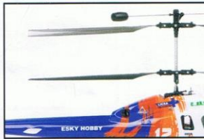
Main blades are not tracking in the same plane 主旋翼旋转不在同一平面