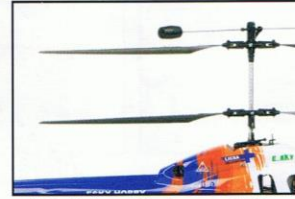
Main blades rotate in same plane 主旋翼旋转在同一平面