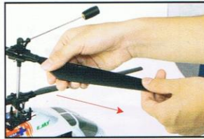
用左手抓住桨的根部，用右手捏住桨叶由里向外滑动，重复此动作。Please adjusting the main blade like this way until the tips are tracking in the same plane